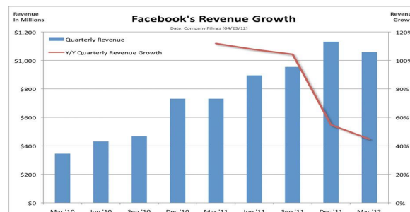
Facebook Revenue Growth (Blodget, 2012)

Another revenue source is Facebook Credits, which is the online currency bought by users and the only method of payment for Facebook's online games such as Pet Society and Farmville. The currency can be used as well in order to buy virtual gifts and cards and also to participate in charitable donations. Facebook saves a 30% share of these credits. (O'Neill, 2010)