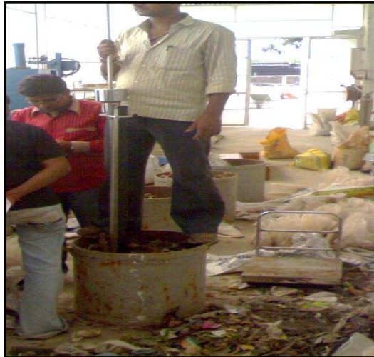
Figure 1: Dynamic Cone Penetrometer Test

The penetration will be measure along the all directions in mould and find average penetration from all trials. This same procedure will led after mixing of fly ash and lime with different proportions. The mixing of fly ash done using layer method. Means take a specified proportion of fly ash and lime and mixing uniformly in a container. Then spreading a one third of mix on the dump and laid properly. The second layer of dump will be spread on the mix and continue this procedure onwards up to third layer of mix.