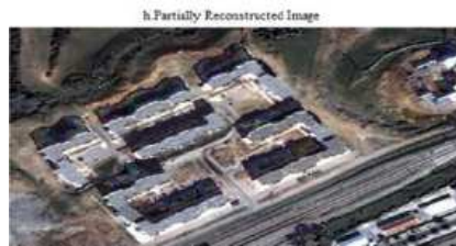
Figure 5: VHR Image Simulation Results