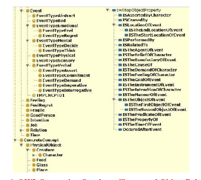
Figure 6: OWL Supporting Ontology, Classes and Object Relations

In addition, the composite concept Bad Event is also an implicit type of knowledge that was not explicitly mentioned in text, yet it can be inferred based on the atomic concepts that were explicitly mentioned in the text as well as the previous knowledge that is incorporated within the supporting ontology i.e. the T-Box assertion.